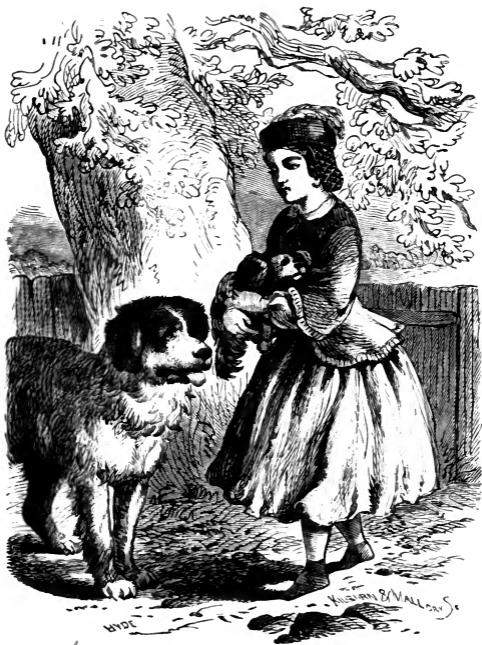
LEO AND TINEY. Page 13.